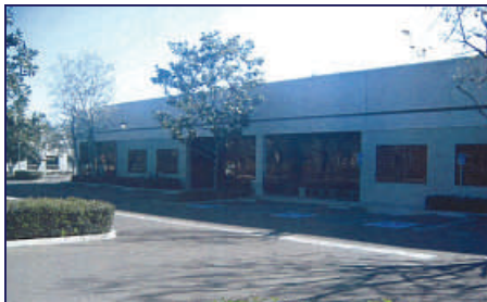
19756 Prairie Street-20,898 sf