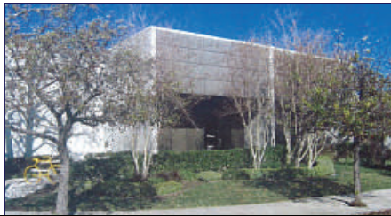
19735 Dearborn Street-24,350 sf High quality improvements, quiet cul-de-sac