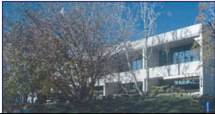
19749 Dearborn Street-35,400 sf 24' ceiling clearance, exterior loading dock.